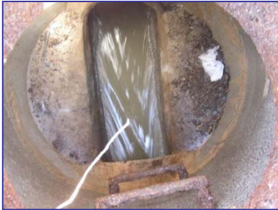
Design of the Government Street – South Acadian project started in August 2009.

This project includes the upgrade of gravity sewers upstream of PS3 and PS4 to alleviate SSOs in the vicinity.