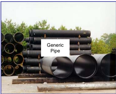
Approximately 12,270 linear feet of new 8 to 24-inch gravity main will be constructed in the project area.