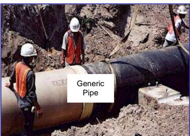
A total of 12,270 linear feet of new various sizes of gravity main will be installed in the project area.